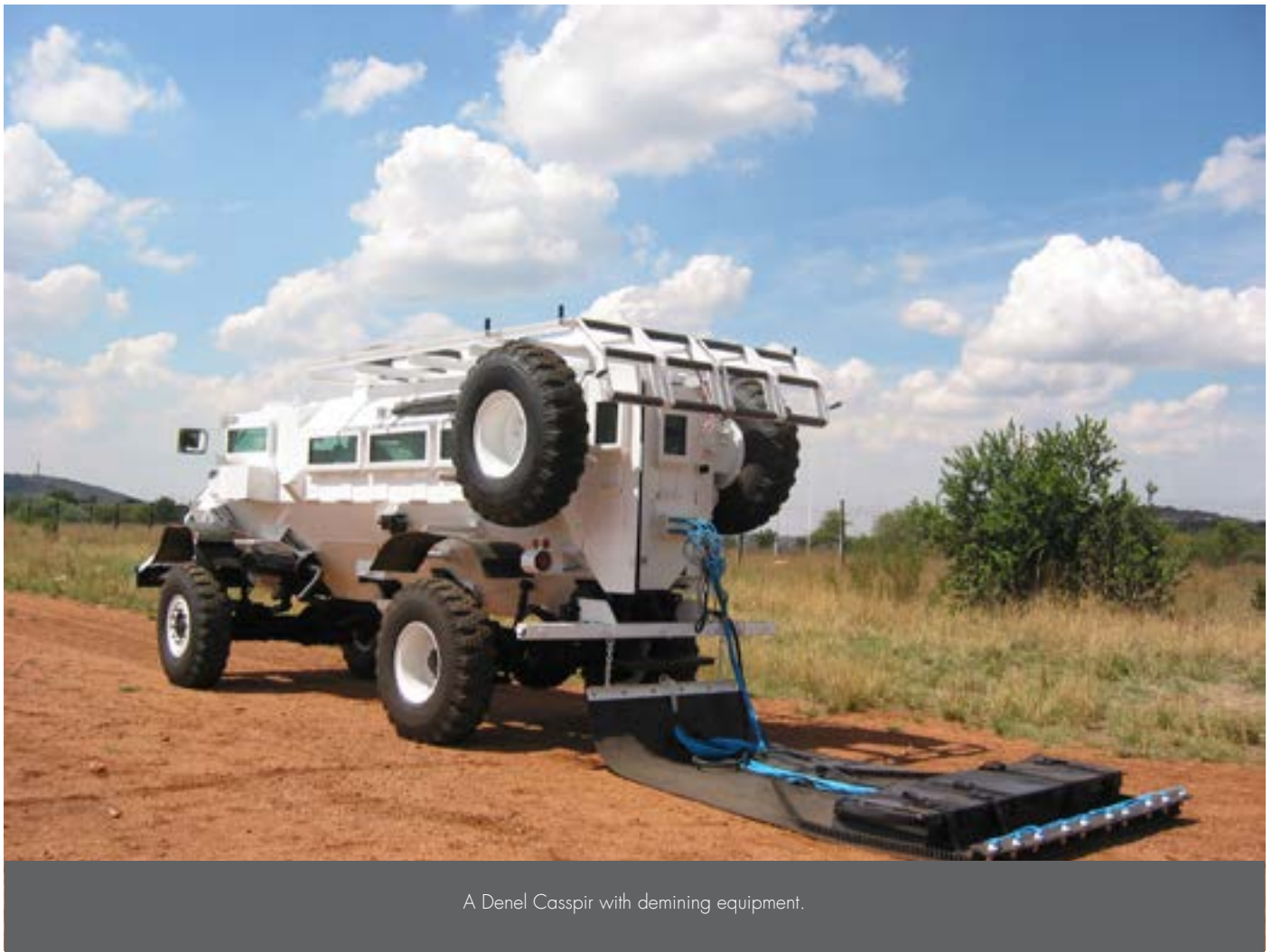
A Denel Casspir with demining equipment.