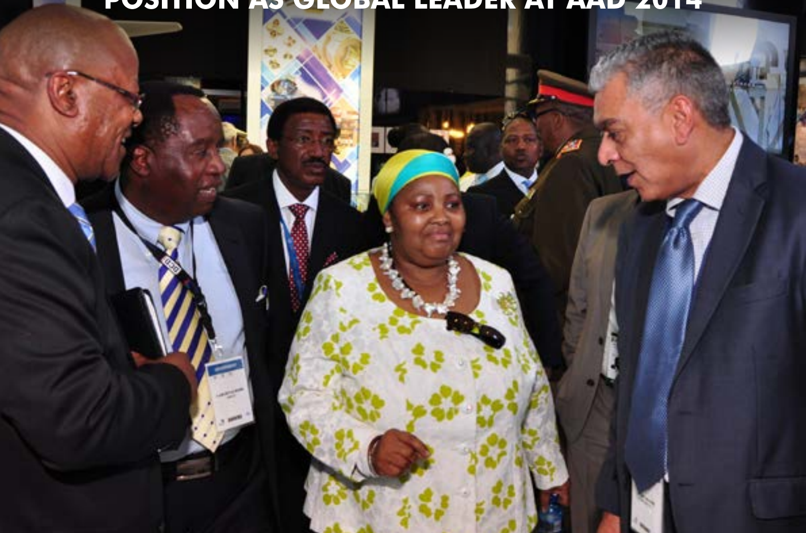
Ms Nosiviwe Mapisa-Nqakula, Minister of Defence and Military Veterans visiting the Denel stand at AAD 2014

"In South Africa, we have a capable company.....a very capable company within the aerospace, defence and security sectors, Denel. Talk to them, sign deals with them and do business with them with confidence. It is a company we are very proud of as government and if you do business with them, I can assure you, you will agree with us!" These were the words of the Minister of Defence and Military Veterans, Ms Nosiviwe Mapisa-Nqakula, to a roomful of foreign and local guests at the AAD 2014 Gala Dinner hosted by the Minister on the 18th September in Centurion. Many decision-makers and political leadership from the continent and other countries all over the world, as well as South African Ministers, Deputy Ministers and leadership within South Africa's defence and security clusters attended the event.