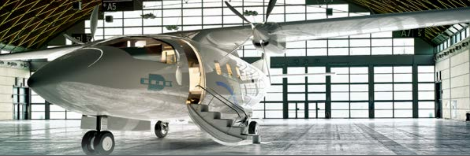
An artist's impression of SARA