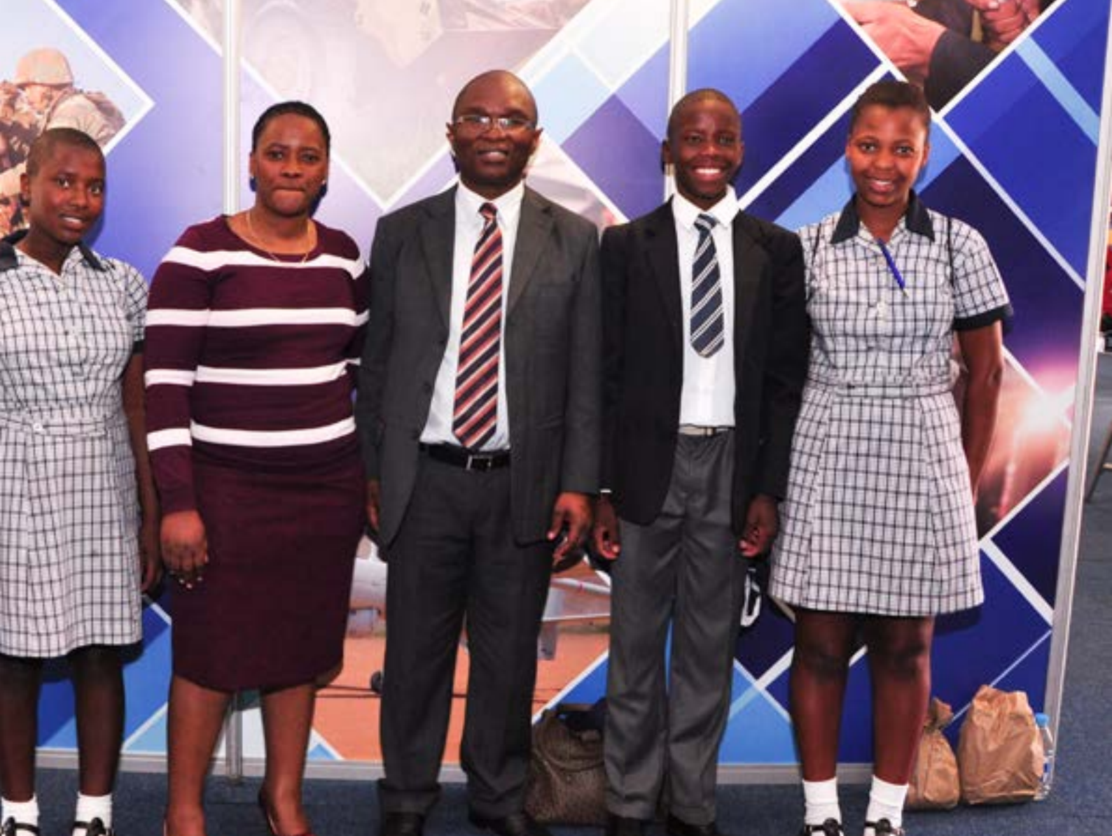
Deputy Minister of Public Enterprises, Bulelani Magwanishe with learners from Mbenge Secondary School in the Eastern Cape at YDP