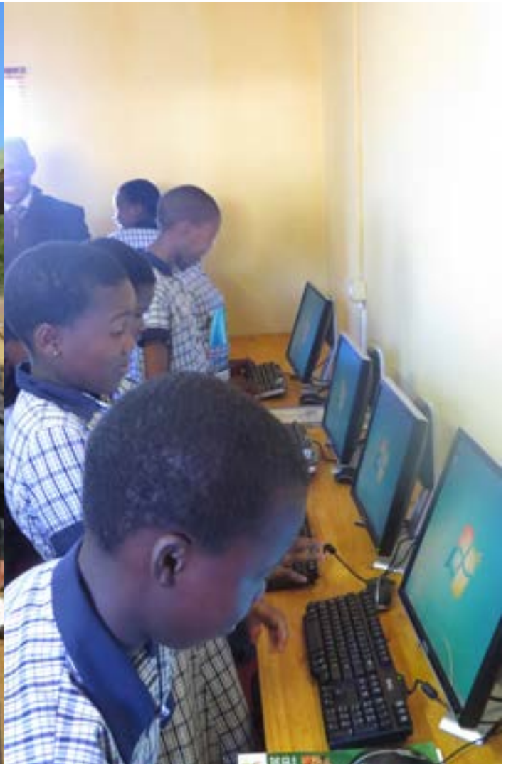
Learners trying out the new computers during the handover ceremony