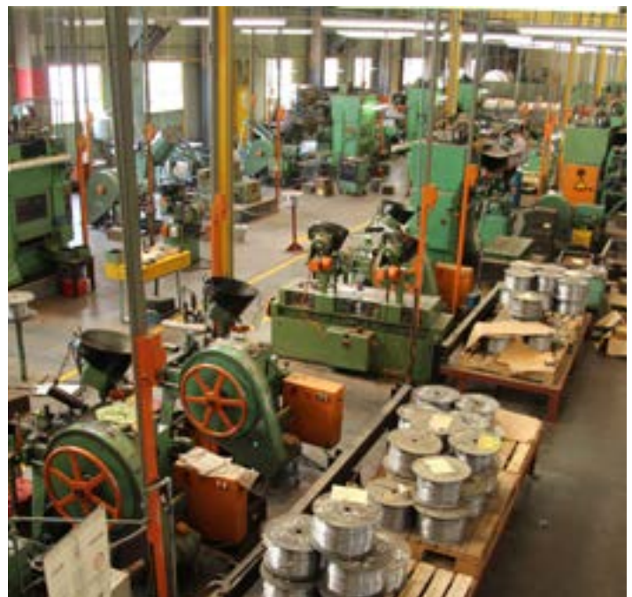
PMP manufacturing plant