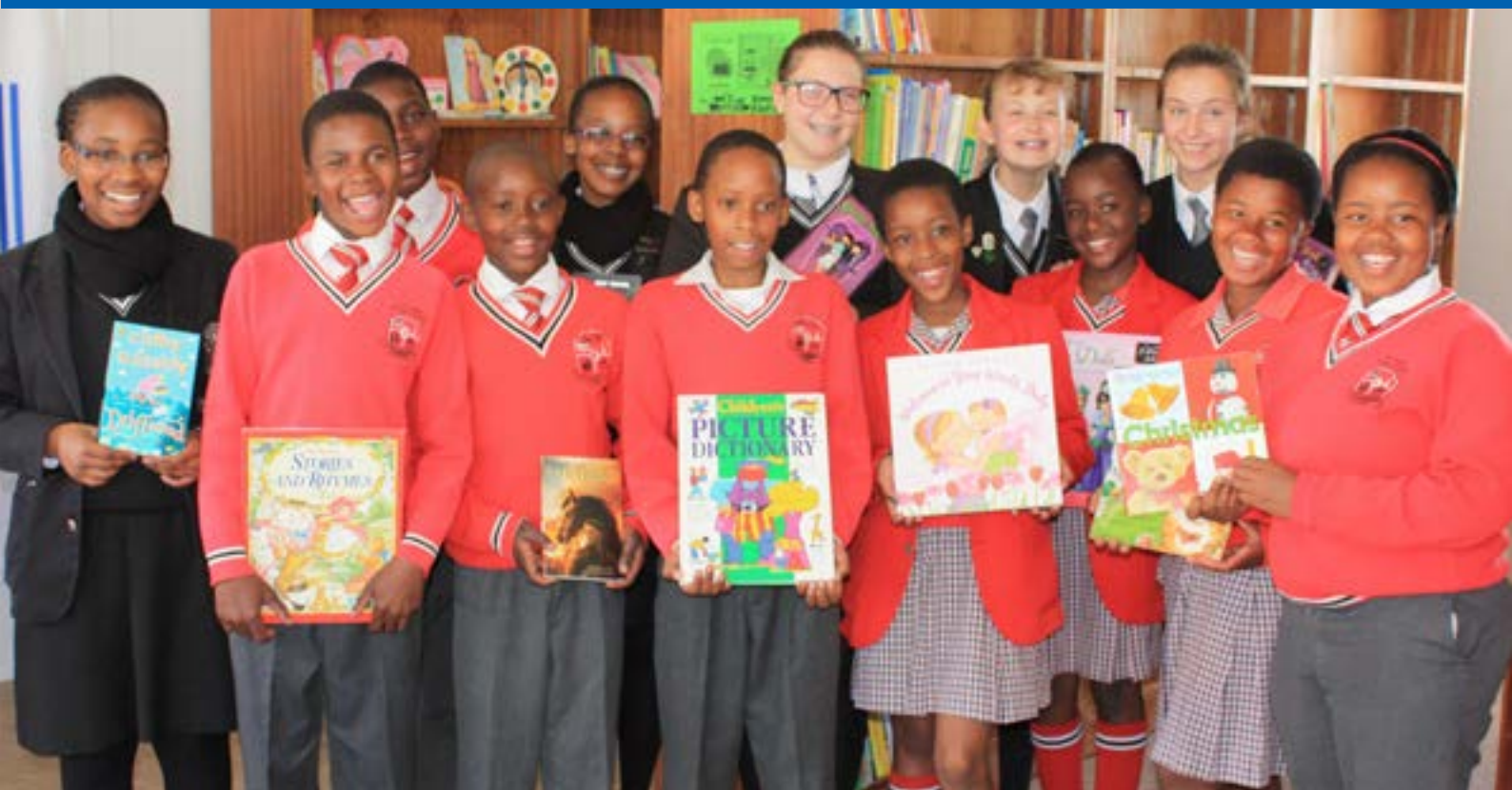
Learners from OR Tambo Primary School (in red) and St. Dominics Catholic School

The O R Tambo Primary School in Tembisa has received a fully equipped library donated by Denel Aviation as part of its annual Mandela Day activities.