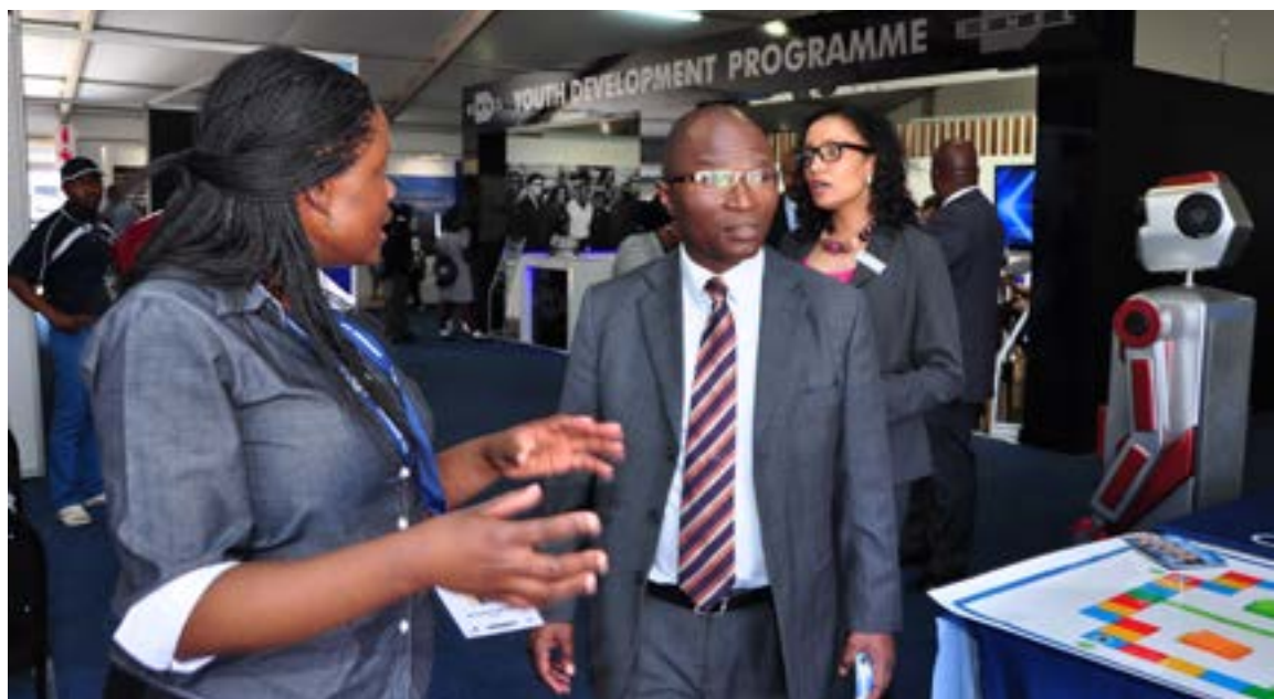
Deputy Minister at the AAD 2014 YDP stand