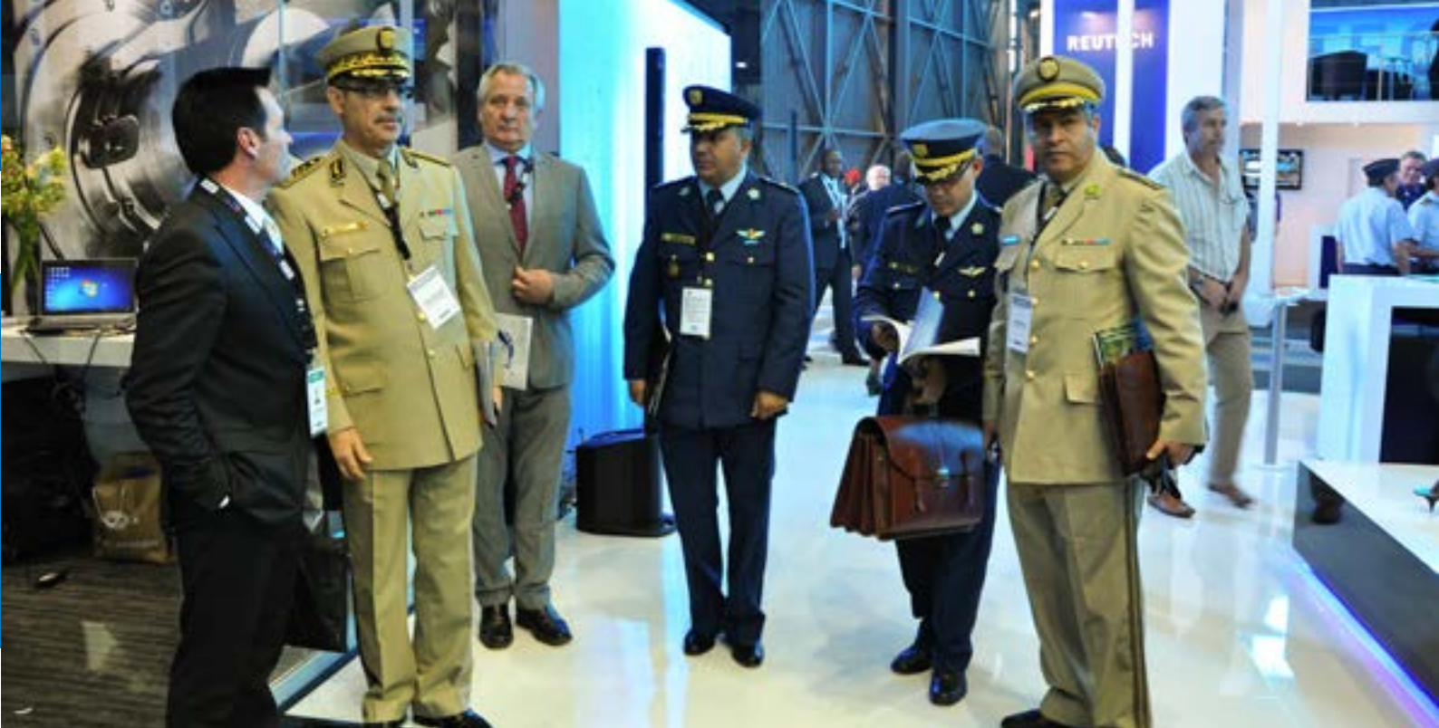
Foreign delegations visiting the Denel stand