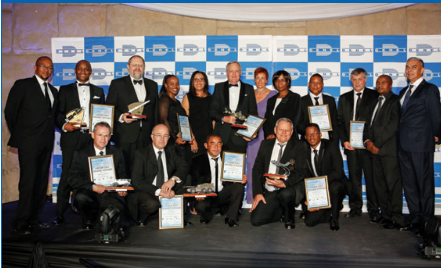
Award winners together with Denel Management, Board Members and representatives of the Department of Public Enterprises.

"For the first time the various accolades were renamed to reflect some of the iconic products that have built and sustained Denel's reputation"