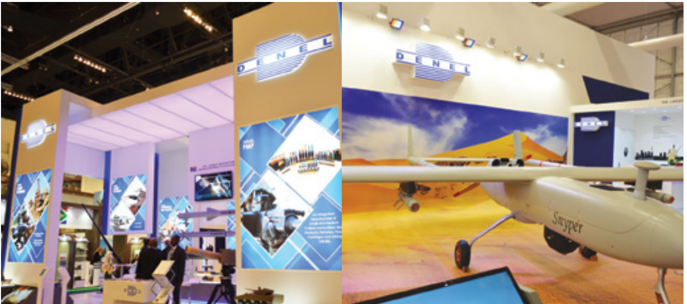
Denel stands during IDEX 2015.

Denel's Seeker 400 is a versatile unmanned aerial vehicle that brings enhanced situational awareness to tactical reconnaissance operations. The newly developed UAV builds on the successful technology utilised by Denel Dynamics for its Seeker 2 and Seeker 200 which have been operational in the UAE.