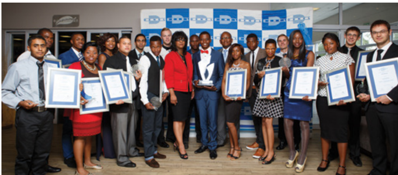
Hard working students from the Denel Technical Academy