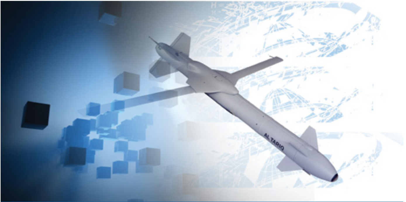
Al-Tariq missile manufactured by Tawazun Dynamics